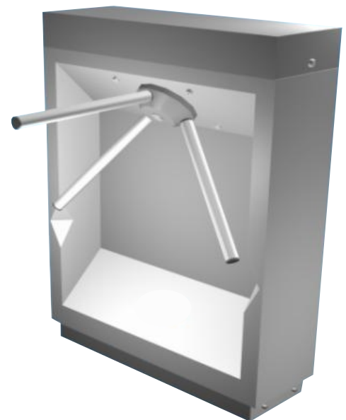
SST NT- III