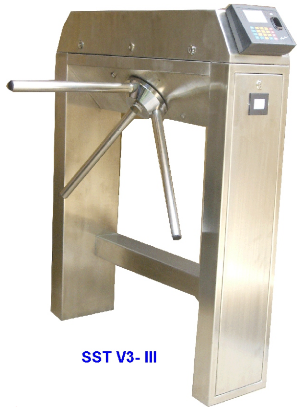
SST V3- III